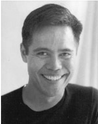
Dr. Evan Adams

Dr. Evan Tesla Adams is a Coast Salish writer/actor and physician from the Sliammon Band in BC. As a "Role Model" with the National Native Alcohol & Drug Abuse Program he worked with Native youth in health promotions and life-skills across the country. He has won Best Actor awards from First Americans in the Arts, the American Indian Film Festival, and an Independent Spirit Award. Dr. Adams completed his residency as Chief Resident at the UBC Aboriginal Family Medicine Program, is a founding member of the Canadian Aboriginal Leaders in Medicine, is a Board member of the Indigenous Physicians Association of Canada, and is the Director of Aboriginal People's Health, within the Faculty of Medicine at UBC.